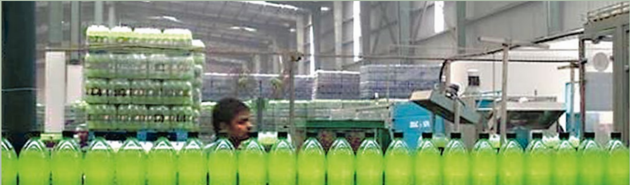
Varun manufacturing plant, India (Daily Post, India 19.10.2017).

Varun Beverages Ltd (VBL) is an Indian based bottling company specialising in carbonated soft drinks and non-carbonated beverages. VBL has 20 manufacturing plants in India and 5 outside India. Its main client is PepsiCo.