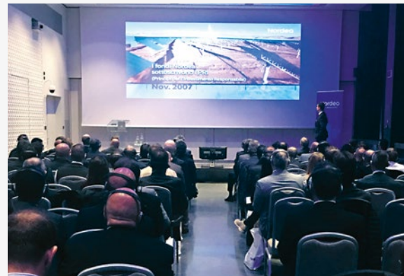
ESG Day event in Milan, Italy.

Exploring new ways of engaging with our clients, NAM launched an interactive ESG e-learning tool at the end of 2018. The goal was to equip advisors with a solid foundation on the various themes and topics that surround ESG investing, to guide them through the ESG jargon and to help them have a conversation with their clients about responsible investment. Due to its huge success and high demand, the language selection for the e-learning will be expanded to seven during 2019.