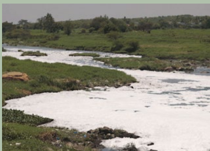
Poluted river outside Hyderabad, India.

Based on the two reports Nordea commissioned on water discharge from the pharmaceutical industry in India, we have continued to engage with the pharmaceutical industry regarding supply chain management. Water pollution resulting from pharmaceutical manufacturing drives antimicrobial resistance. Last year, we went to New York to meet several US-based pharmaceutical companies and engage on their supply chain management.