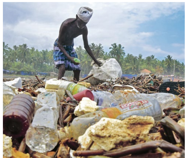
The New Indian Express online news, 05 June 2018.

After gaining insight into the Indian recycling industry, we know where to focus our attention in NAM's Indian holdings regarding plastics. Companies with high exposure to bottom of the pyramid strategies will be more likely to sell single-serve products in multi-layered wrapping containers. Because recycling multi-layered wrapping is complex, the Indian collection system does not collect it. Hence, it ends up in landfills or waste streams. We will now engage with companies with bottom of the pyramid strategies to ensure that they are prepared for potential stricter regulation and are researching more environmentally friendly packaging.