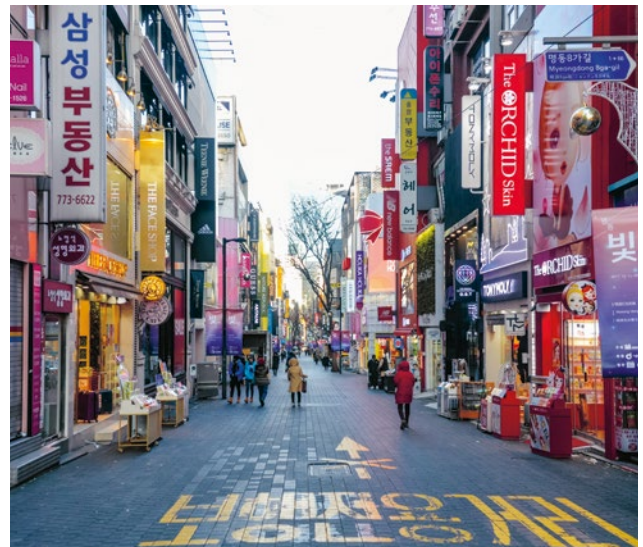
Myeongdong district, Seoul, South Korea.

Examples of positive corporate governance steps we saw in 2018 are: increase of management diversity through higher levels of non-Koreans in senior management positions, increased share buybacks to address excessive unused cash on balance sheets, and an increase in company and union collaboration.